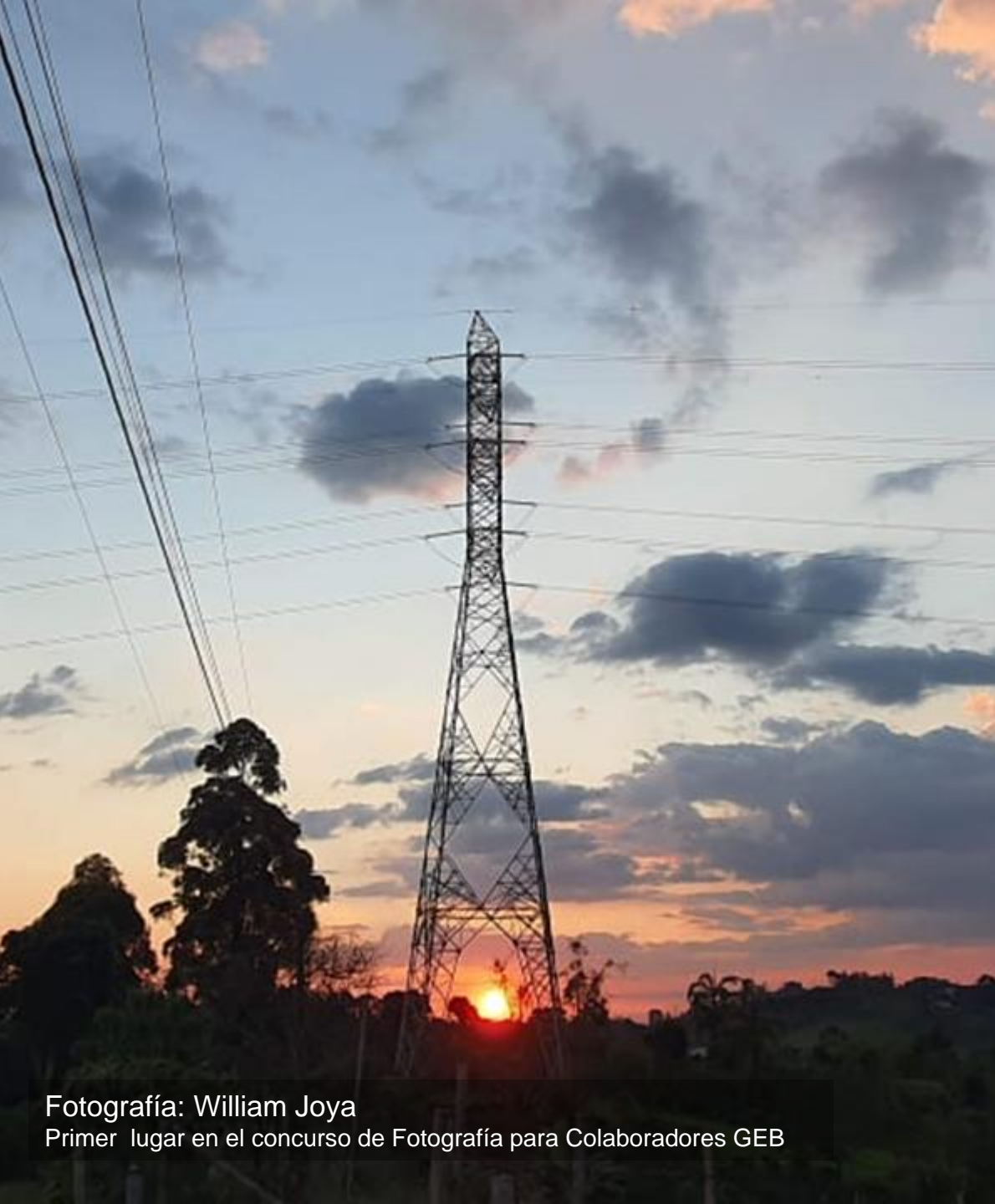
Primer lugar en el concurso de Fotografía para Colaboradores GEB